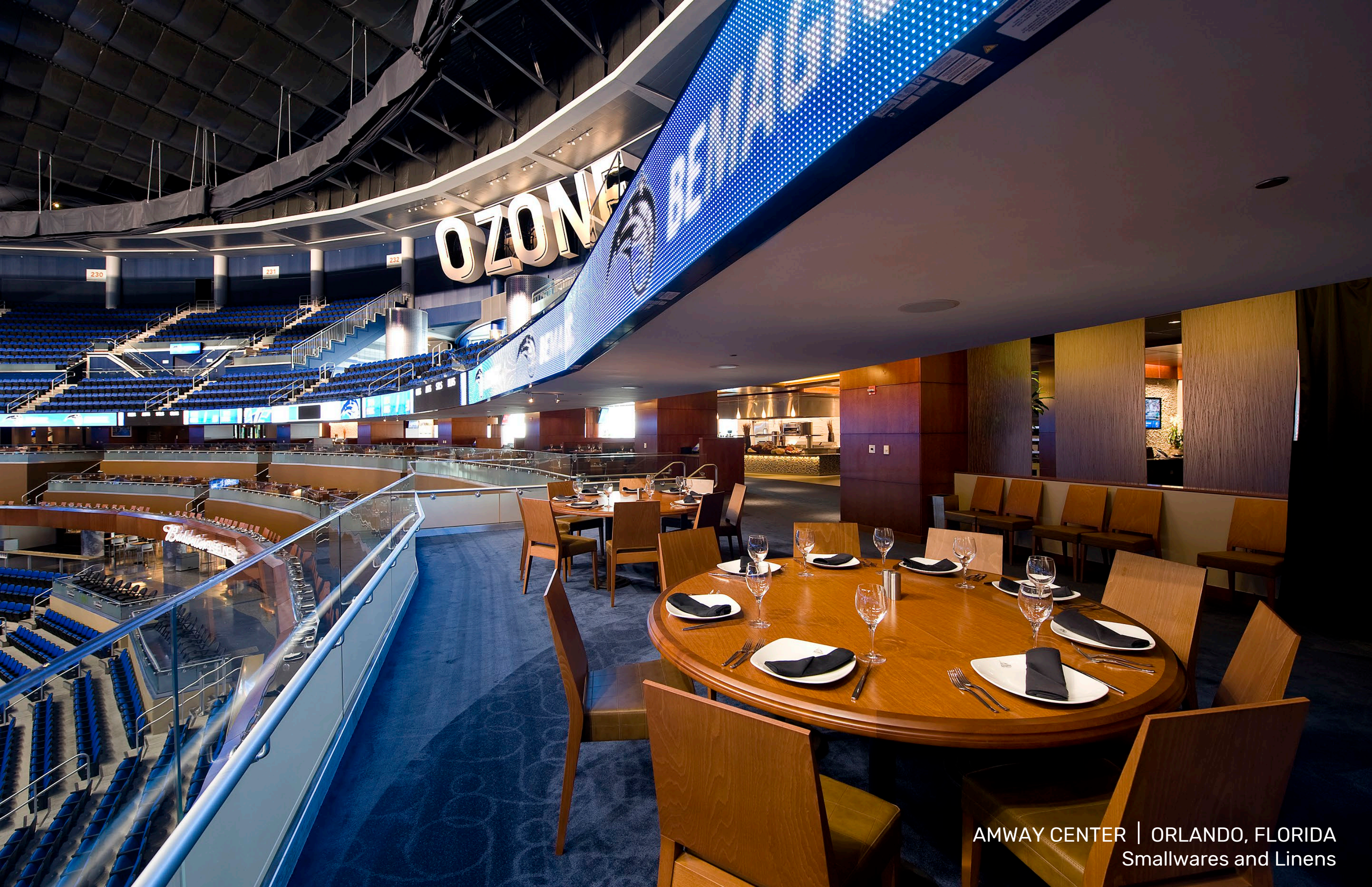
AMWAY CENTER | ORLANDO, FLORIDA Smallwares and Linens