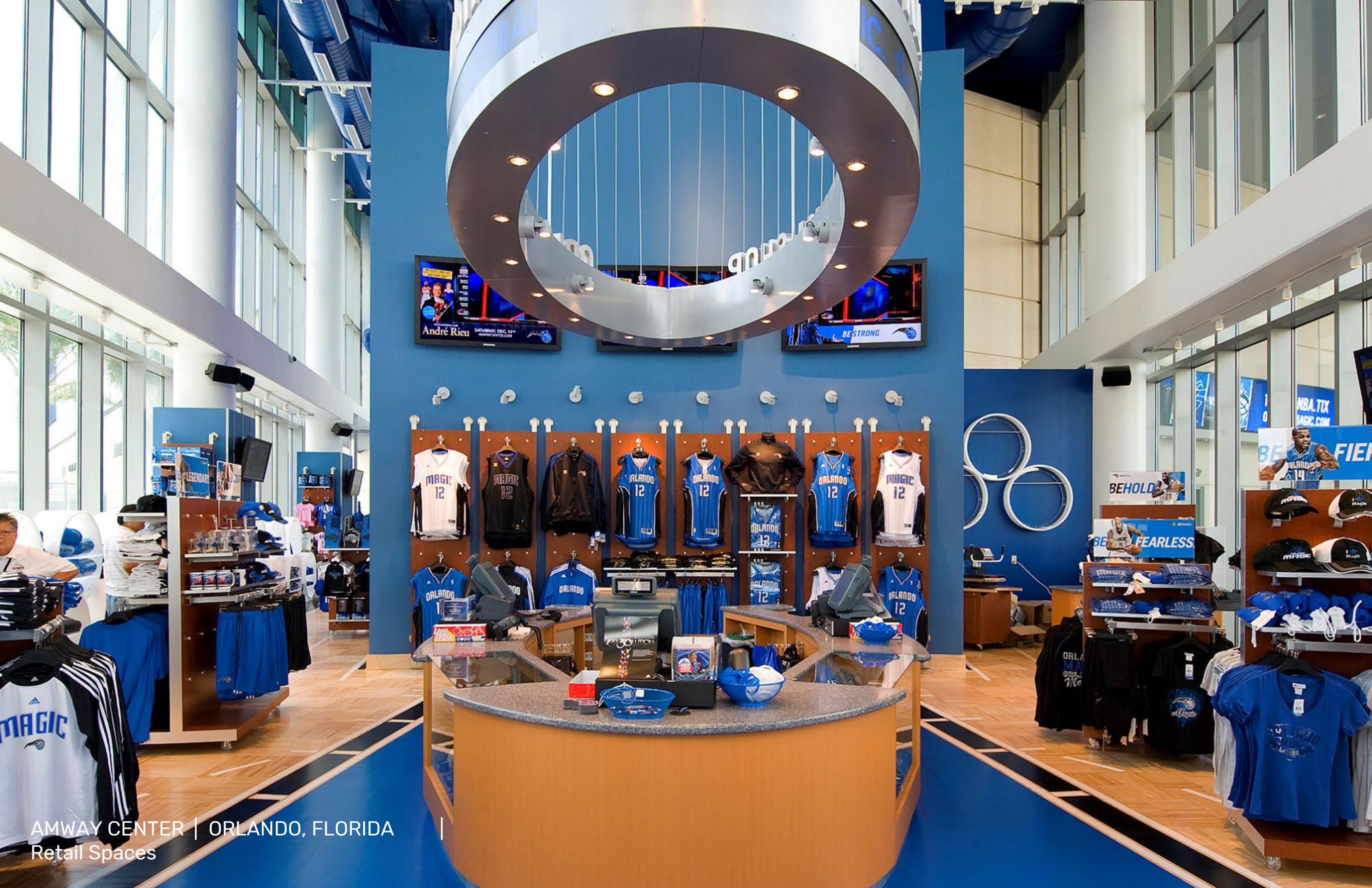
AMWAY CENTER | ORLANDO, FLORIDA Retail Spaces