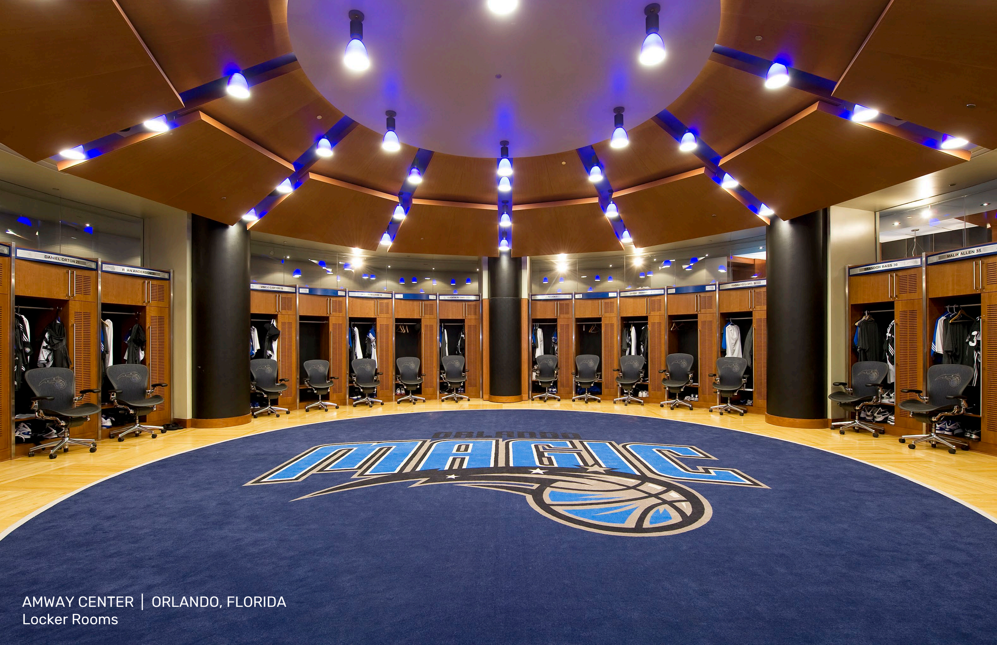
AMWAY CENTER | ORLANDO, FLORIDA Locker Rooms