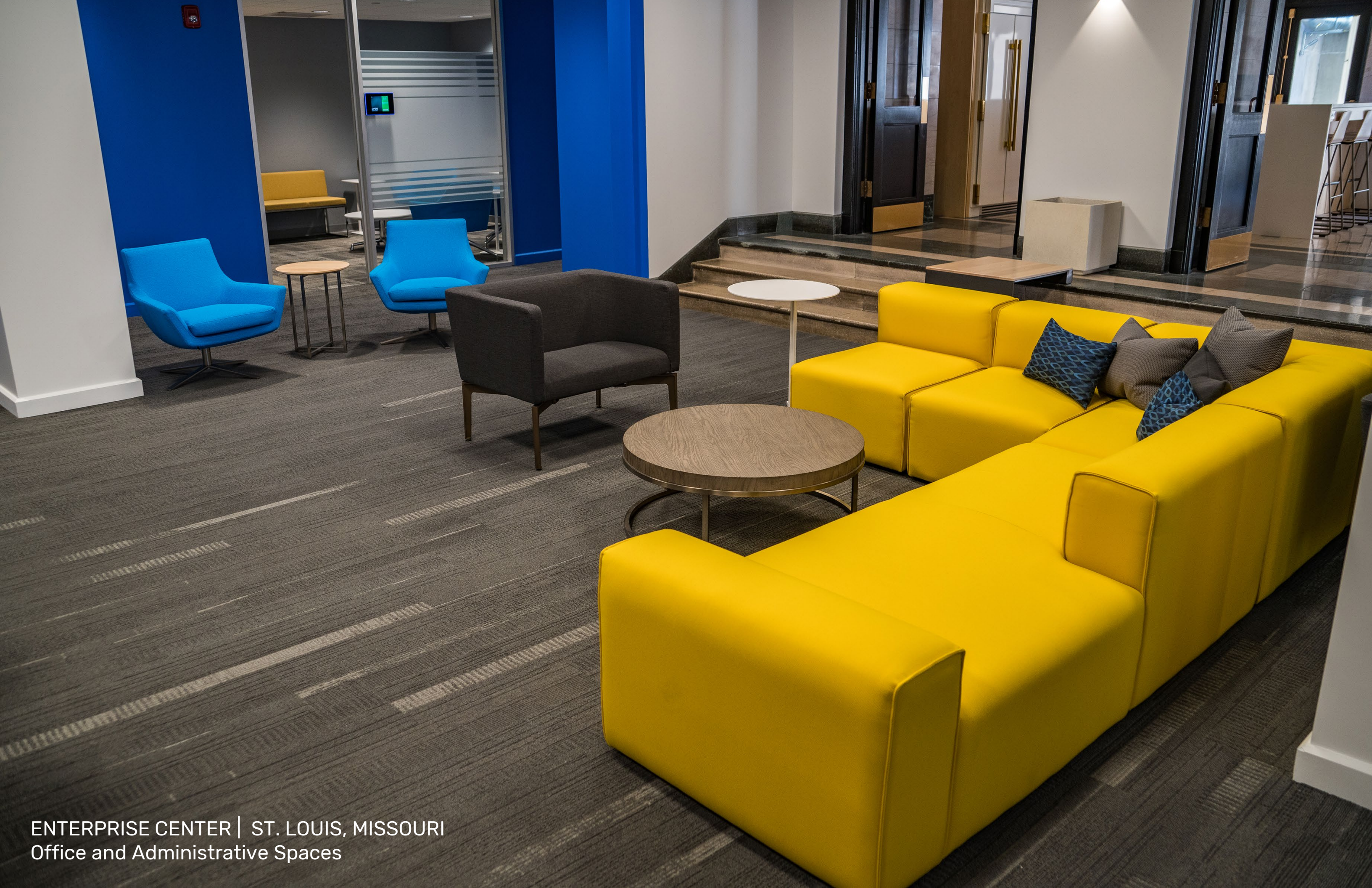
ENTERPRISE CENTER | ST. LOUIS, MISSOURI Office and Administrative Spaces