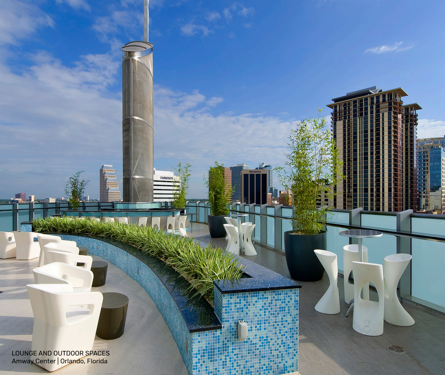
LOUNGE AND OUTDOOR SPACES Amway Center | Orlando, Florida