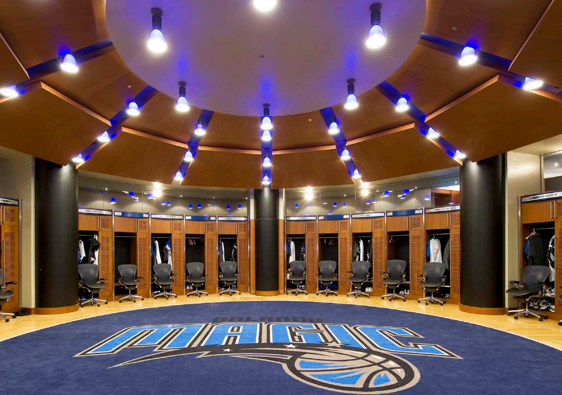
LOCKER ROOMS Amway Center | Orlando, Florida