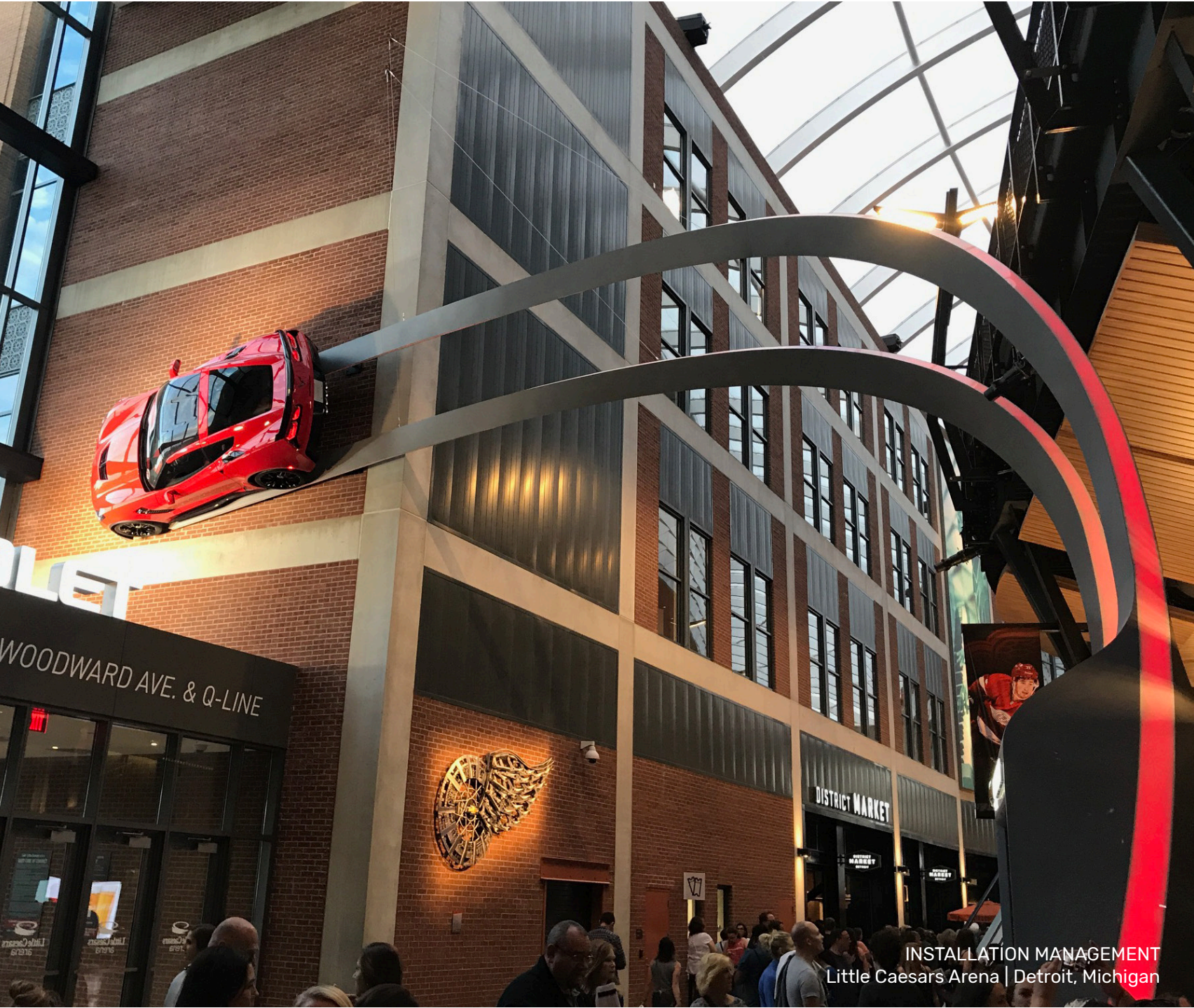
INSTALLATION MANAGEMENT Little Caesars Arena | Detroit, Michigan