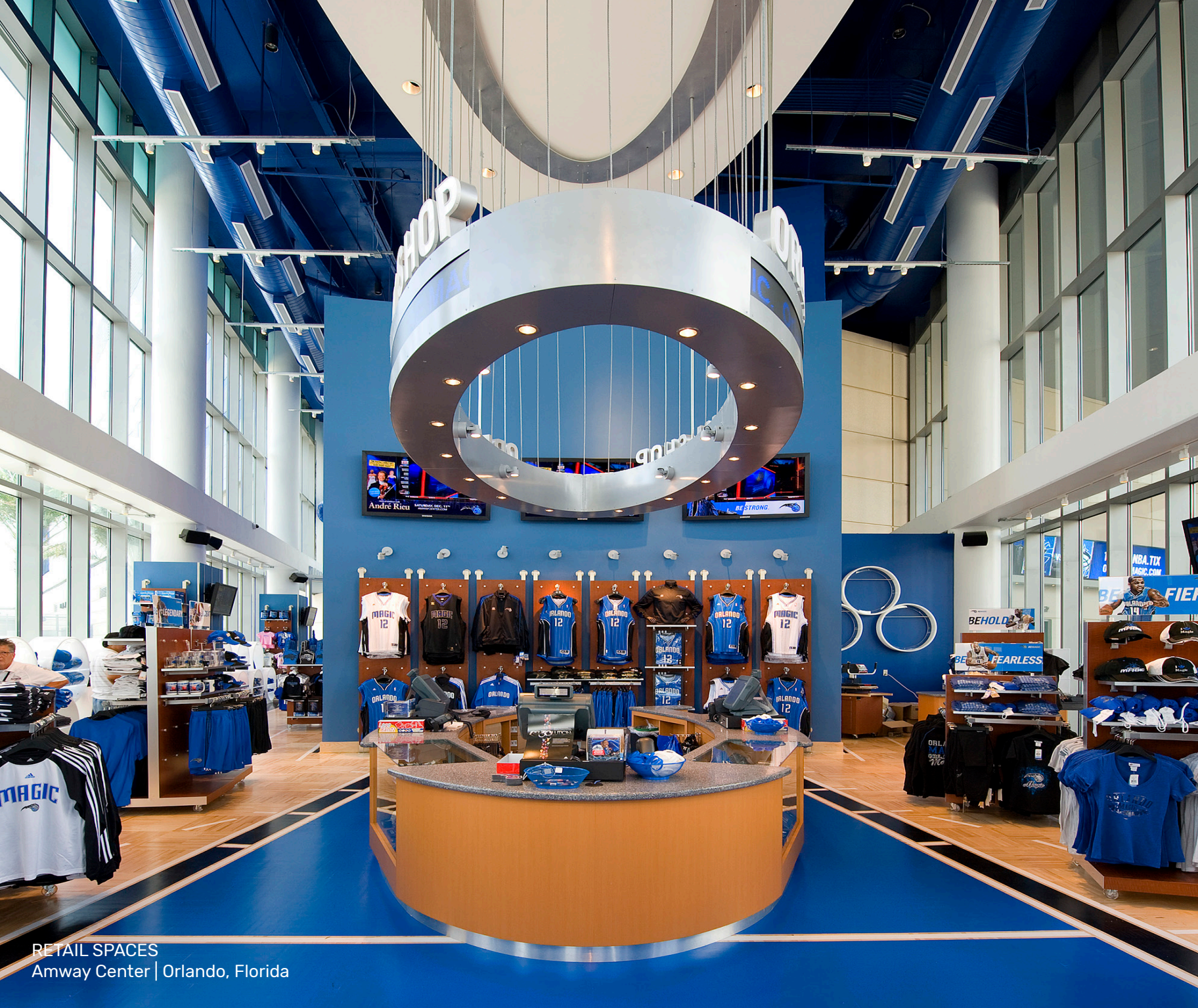
RETAIL SPACES Amway Center | Orlando, Florida