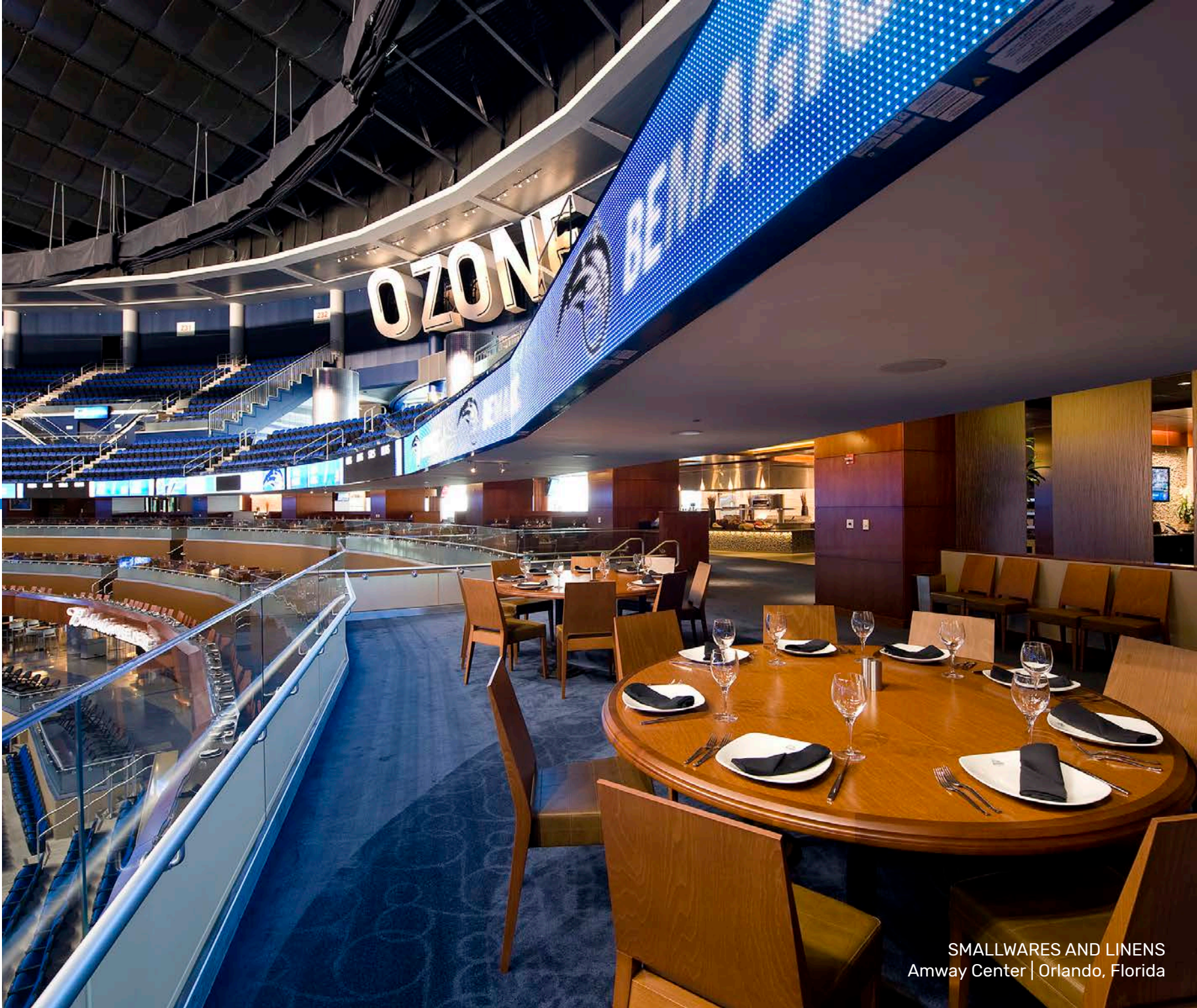
SMALLWARES AND LINENS Amway Center | Orlando, Florida