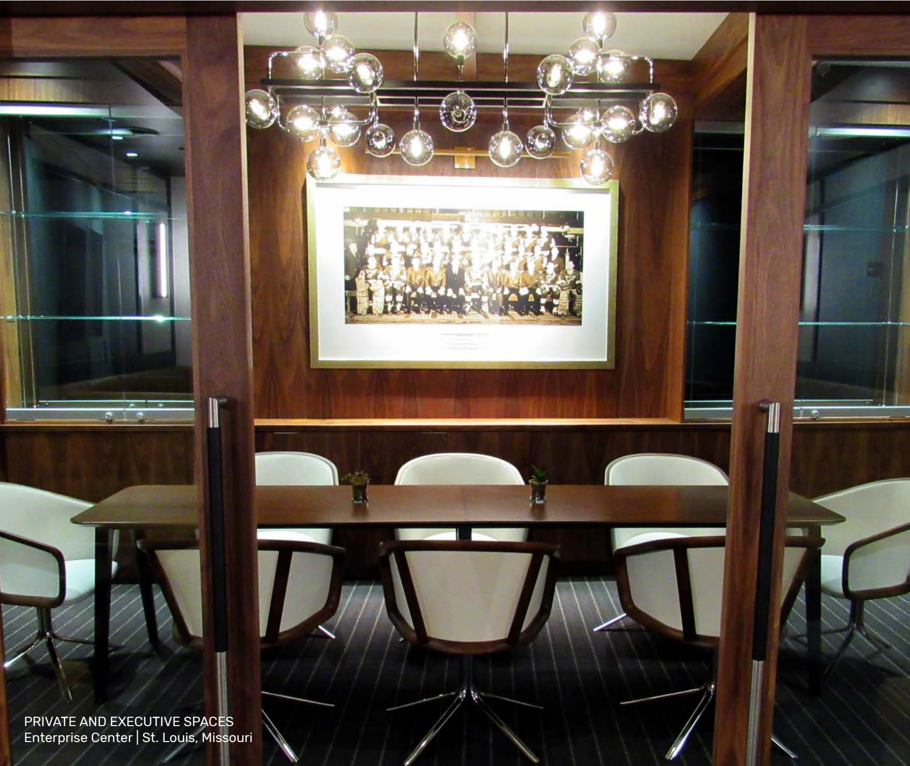
PRIVATE AND EXECUTIVE SPACES Enterprise Center | St. Louis, Missouri