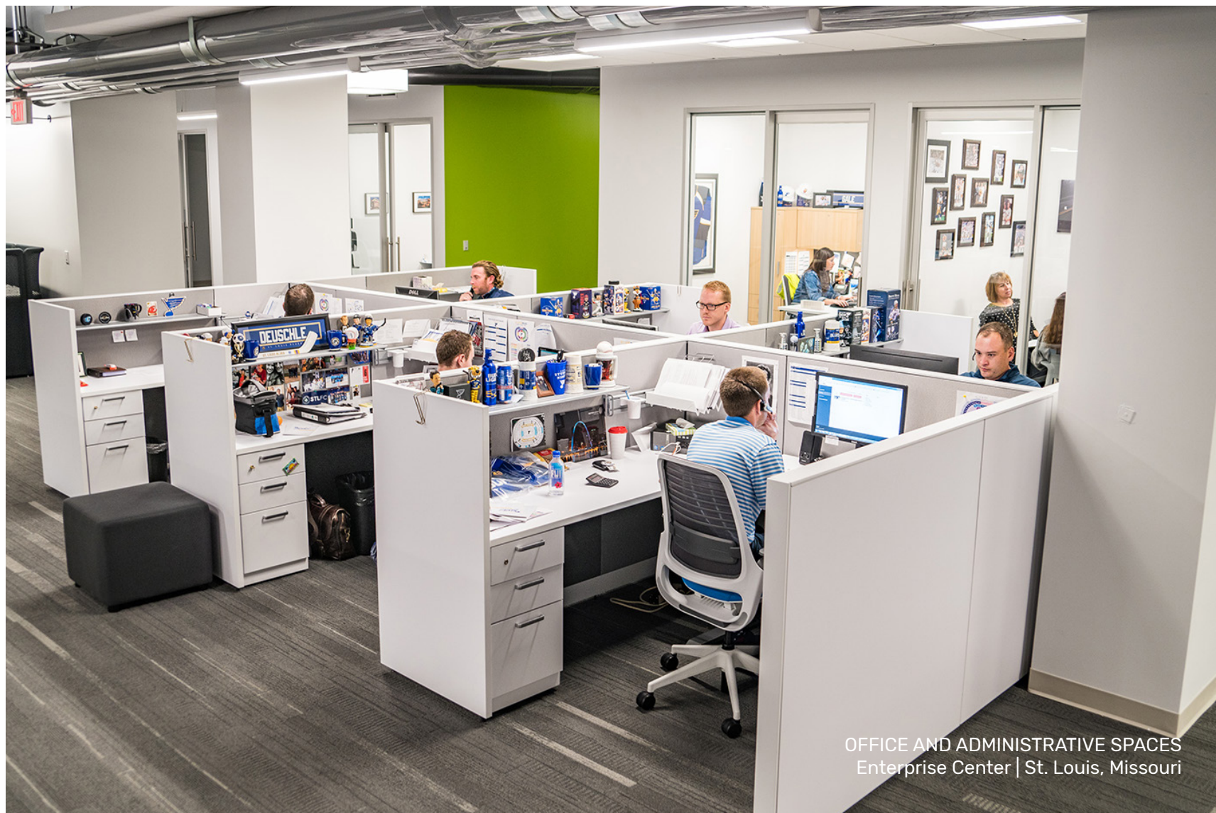
OFFICE AND ADMINISTRATIVE SPACES Enterprise Center | St. Louis, Missouri