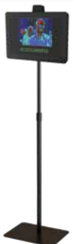
APS-1 pole stand