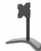
DTM-2 desktop mount